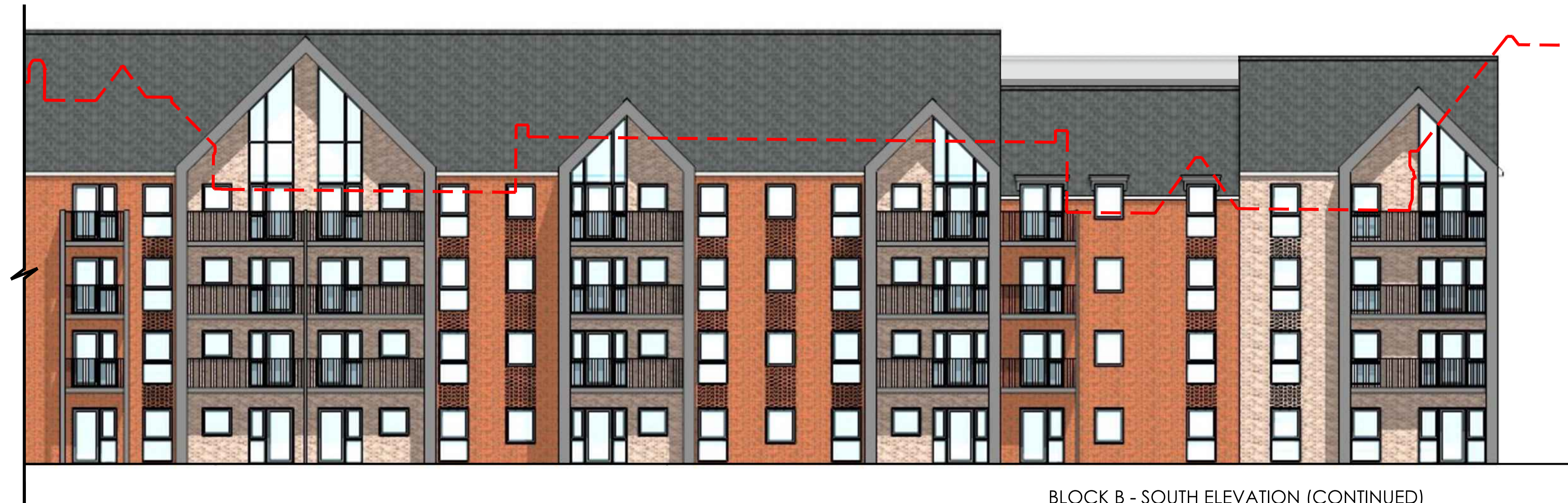
BLOCK B - SOUTH ELEVATION (CONTINUED)