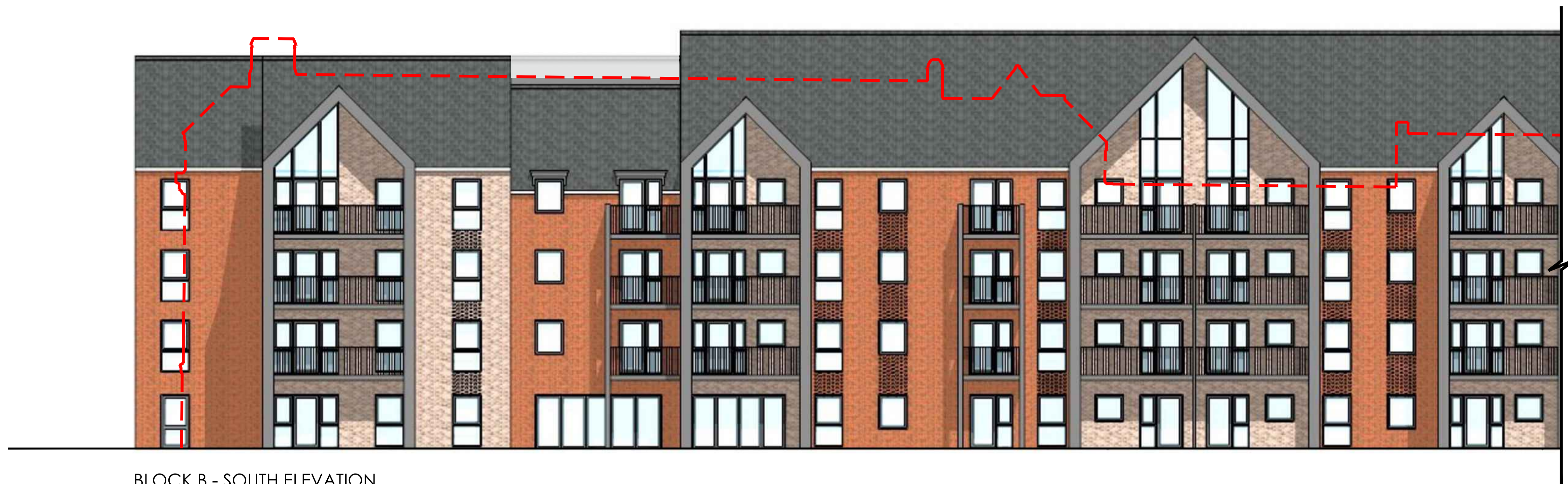
BLOCK B - SOUTH ELEVATION